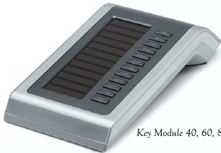
Key Module 40, 60, 80