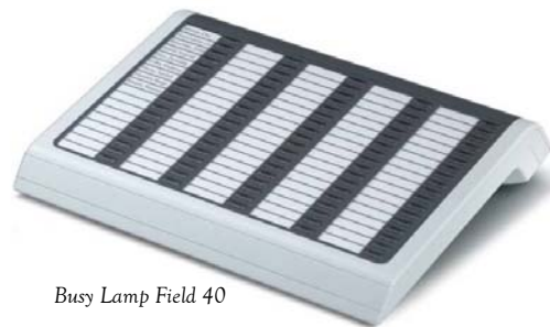
Busy Lamp Field 40

Mother Technologies Limited Davidson House Campus 1, ASTP Balgownie Road Aberdeen AB22 8GT