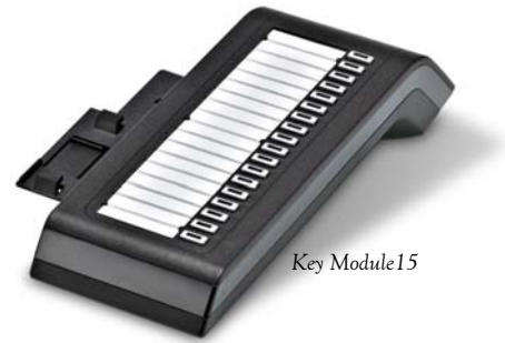
Key Module 15